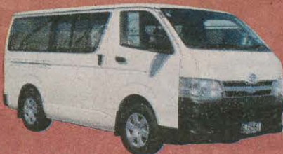
2012 Toyota Hiace ZL $24,930

6 Available!!! 230v Power Connection, D/Bed, Sink, Van is Professionally Fitted Out, 2.4 Petrol