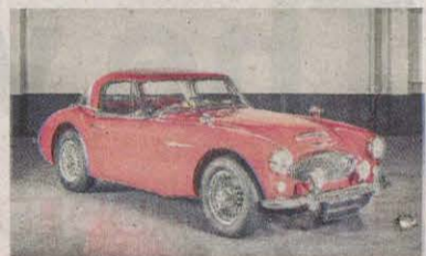
Clockwise: 1969 Mercedes-Benz 280 SL Auto (top); 1969 Jaguar E-type series 2 4.2 coupe; 1965 Austin Healey 3000 BJ8 with hard top; 1955 Jaguar XK140 (above).