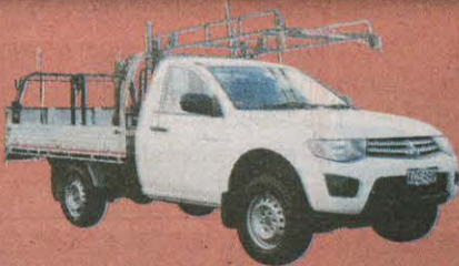
2011 Mitsubishi Triton Flat Deck with Tail Lift $17,990