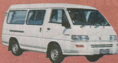
2008 Mitsubishi L300 LWB CAMPER VAN $7,850

3.0L Turbo Diesel, Towbar, Manual, NZ New