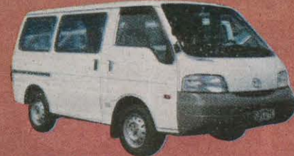
2012 Mazda Bongo $9,830

3.0L Turbo Diesel, Cargo Barrier, Manual, NZ New