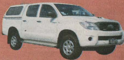
2011 Toyota Hilux 4X4 D/CAB $22,990

3.0L Turbo Diesel, Towbar, Canopy, Auto, NZ New