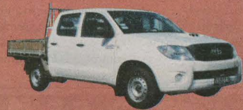
2011 Toyota Hilux 2WD D/Cab Flatdeck $16,930

3.0L Turbo Diesel, Towbar, Canopy, Auto, NZ New